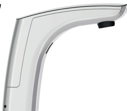
Chrome body & top