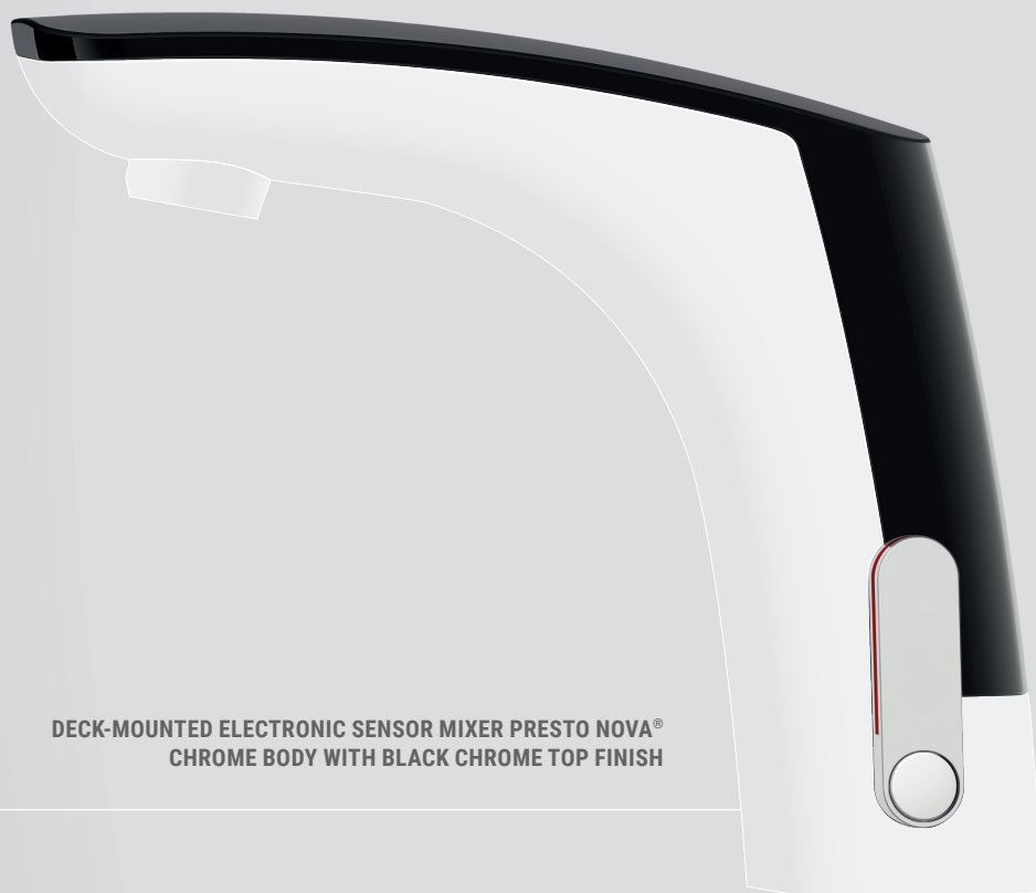
DECK-MOUNTED ELECTRONIC SENSOR MIXER PRESTO NOVA® CHROME BODY WITH BLACK CHROME TOP FINISH