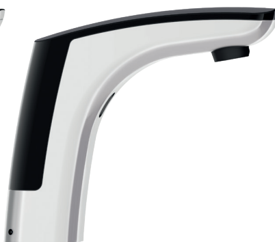
Chrome body & black chrome top