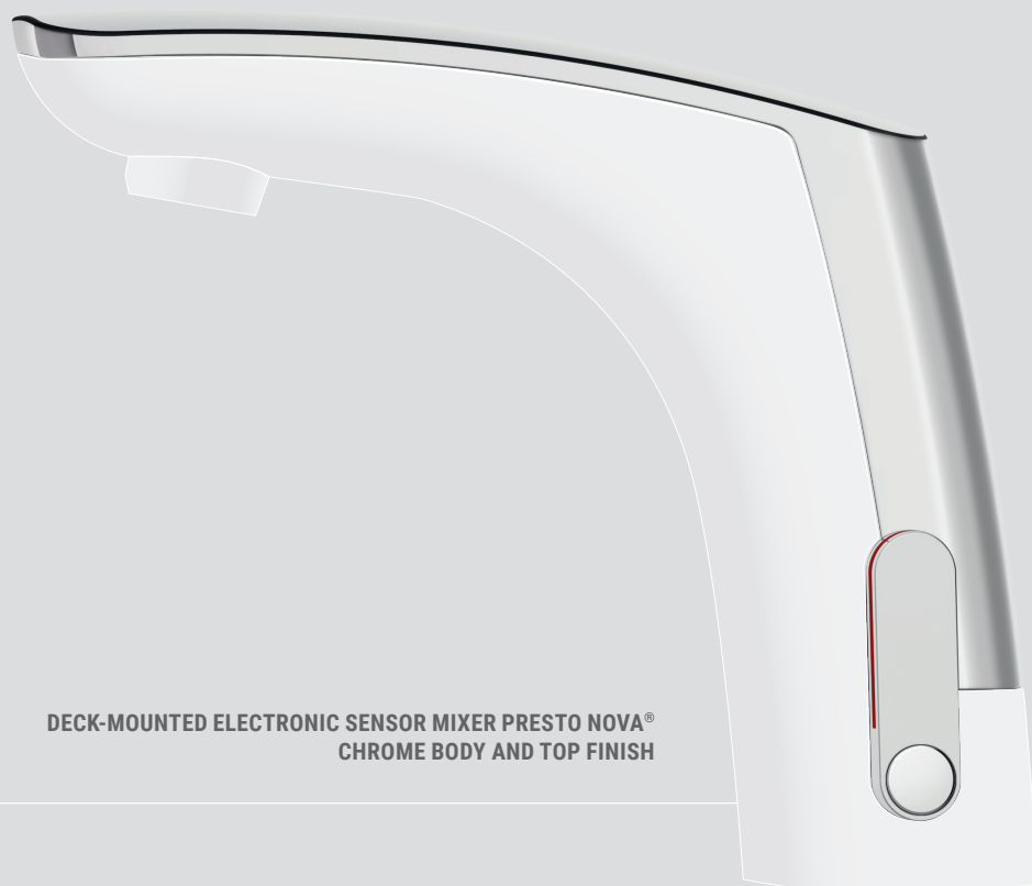
DECK-MOUNTED ELECTRONIC SENSOR MIXER PRESTO NOVA® CHROME BODY AND TOP FINISH

PRESTO has integrated its iconic technology in a brand new range of electronic sensor taps, ready to be installed in offices, commercial buildings and malls. Thanks to a new generation of infrared cell, NOVA® models combine remarkable resistance, endurance, comfort for users, and water savings. Specialist of tapware and sanitary solutions fitted for intensive use in very challenging environments, PRESTO also loves design.