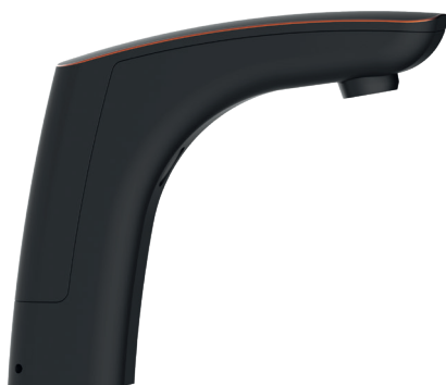
Matt black with copper trim