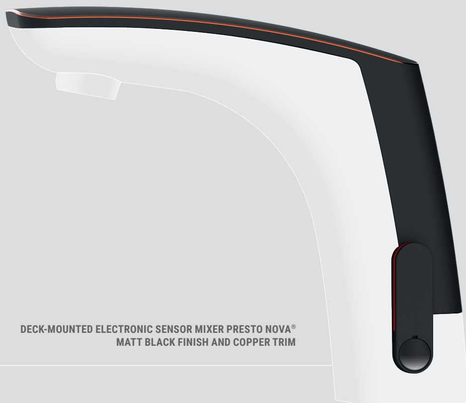
DECK-MOUNTED ELECTRONIC SENSOR MIXER PRESTO NOVA® MATT BLACK FINISH AND COPPER TRIM